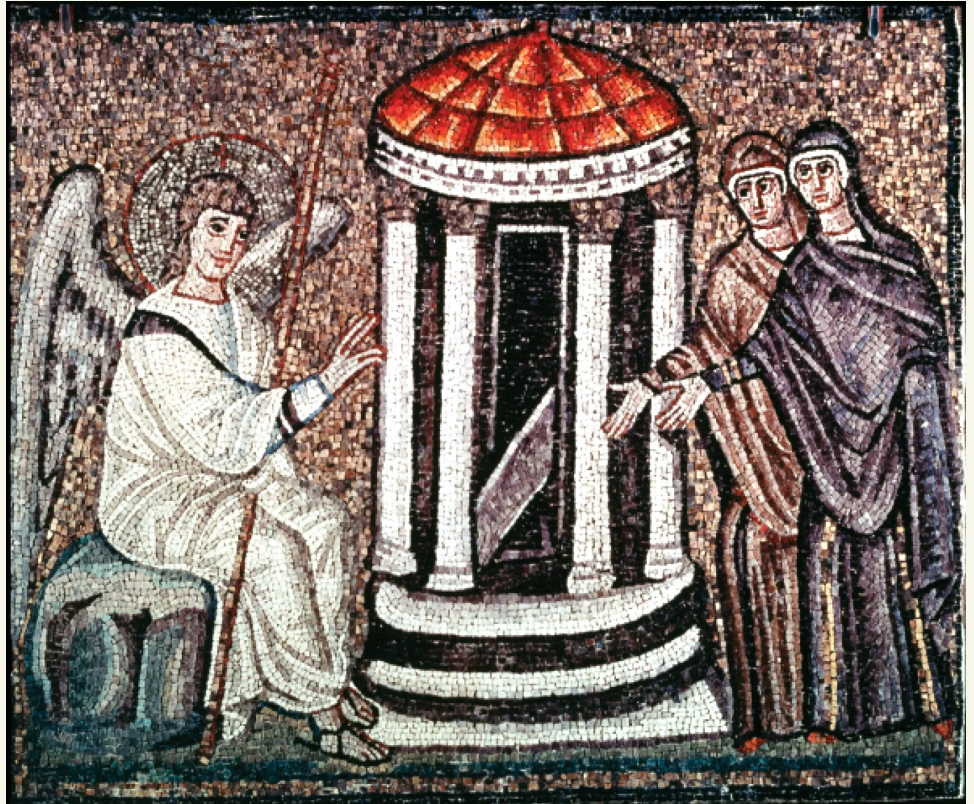
6th-century mosaic of Mary Magdalen and the other women at the empty tomb.

Due to the prohibition on portraying the human form after the Iconoclastic Controversy of the 8 th and 9 th centuries, almost no portrayals of Mary Magdalen exist before the 10 th century. The Iconoclastic Controversy emerged from a literal interpretation of the 2 nd Commandment: “You shall not make any image or likeness of things in heaven, on earth or the sea.” The Iconoclasts took this injunction literally, while for most of the rest of history the commandment was understood to avoid making images of gods to worship. Thus, only one possible image of St. Mary Magdalen exists from the third century, and clearer representations of the saint on a censor and in a mosaic from the sixth century. We know these images are of St. Mary Magdalen because they bear her attributes—symbols which identify her art. St. Mary Magdalen’s attributes are a red egg or a jar of ointment, and the jar is evident in both these images.