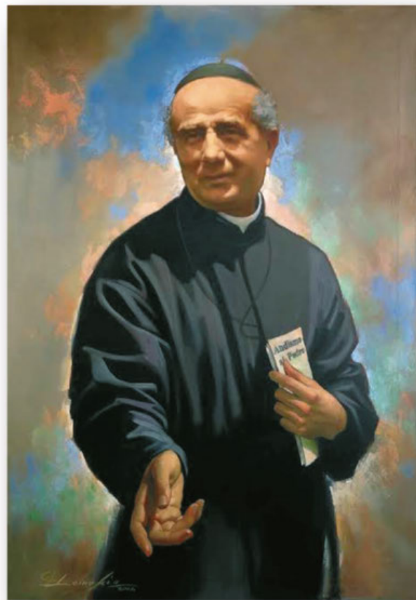
St. Luigi Guanella, 1842-1915

In December 1912, Fr. Luigi traveled to some major cities in the United States and was dismayed by the plight of the Italian immigrants he met. The next year he sent six Daughters of St. Mary of Providence to Chicago to work with girls with intellectual disabilities. He died three years later, and was beatified by Pope Paul VI in 1964.