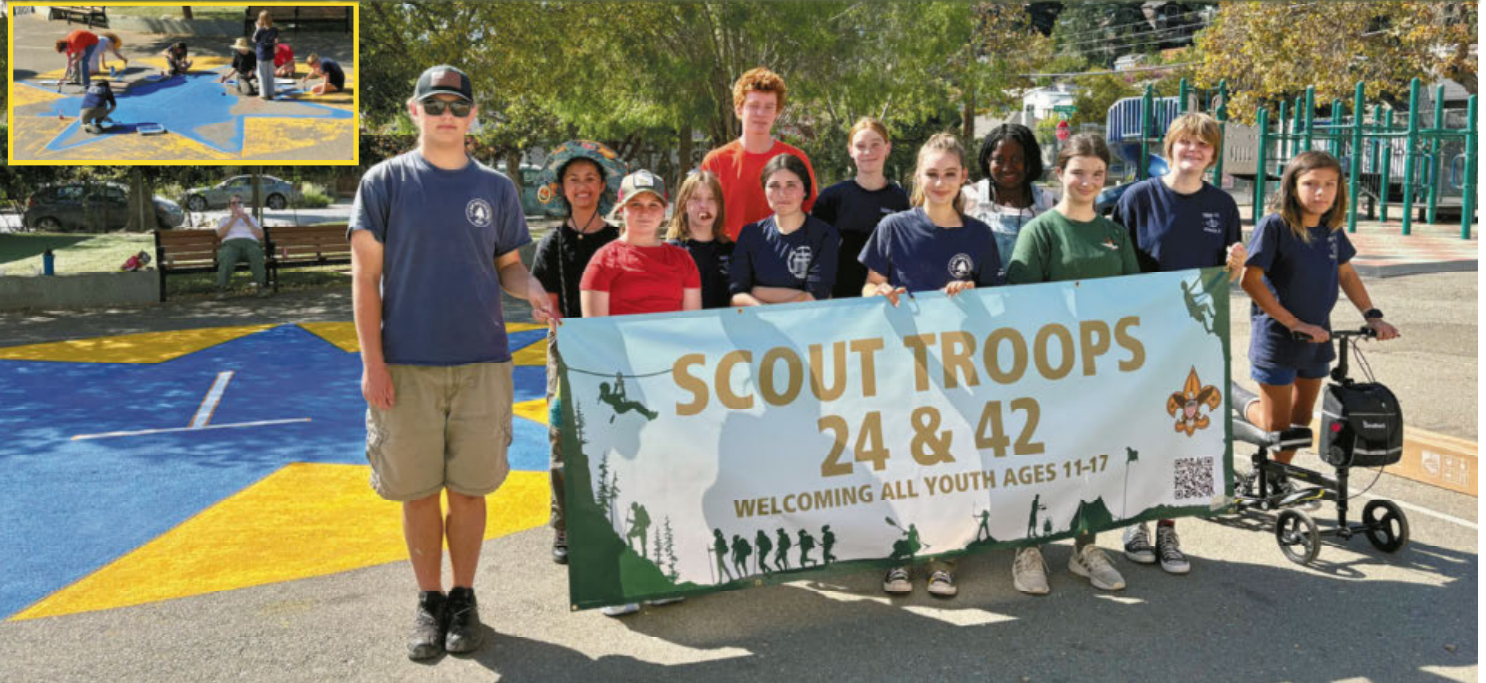
Troop 42—our girls' Boy Scout troop — is thriving at St. Mary Magdalen. The Scouts, working with our veteran Boy Scout Troop 24 — just completed an Eagle Project: refurbishing the playground at Chabot Elementary. Bravo!