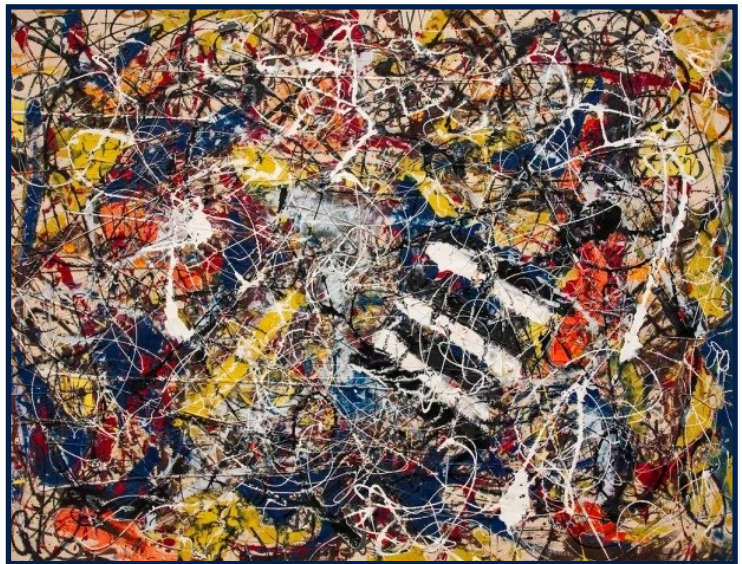
Jackson Pollock, Number 17a (private collection)

Are you willing to let your prayer slip and slide a bit? Can you relax into a reverie that discovers God in unusual places? Which artist best describes your prayer life? He or she could be a painter, sculptor, dancer or writer. There is still a need for formal prayer, and the Eucharist and other liturgies can supply much of it, but allowing the abstract to be part of your prayer life could become a key to your spiritual growth.