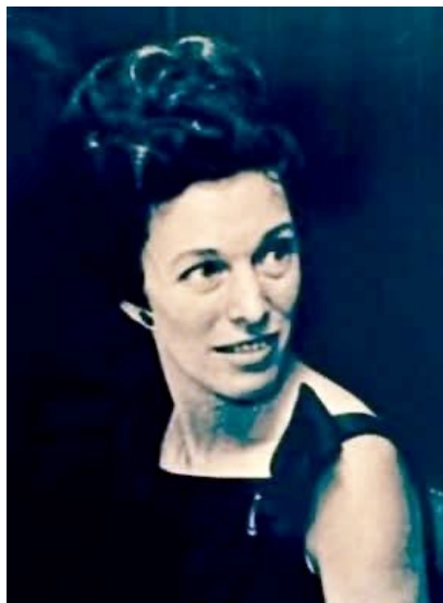
At a conference in Luxembourg, 1969