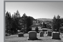
Overlooking Beautiful San Francisco Bay

Serving Local Parishes and All Catholic Cemeteries With the Utmost Care Since 1962