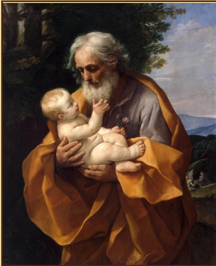
Guido Reni, St Joseph with the Infant Jesus . c. 1620. Hermitage Museum, St. Petersburg, Russia.

The famous scripture scholar, Raymond Brown, once wrote: "There are only two words we can be absolutely certain Jesus spoke, 'Abba', and 'Amen'." The first one is significant for Fathers' Day. Abba is a Hebrew word that literally means 'Daddy'. That this word is prominent in the Gospels says much about Jesus' relationship with his heavenly Father and a lot about the nature of fatherhood for Christian men.