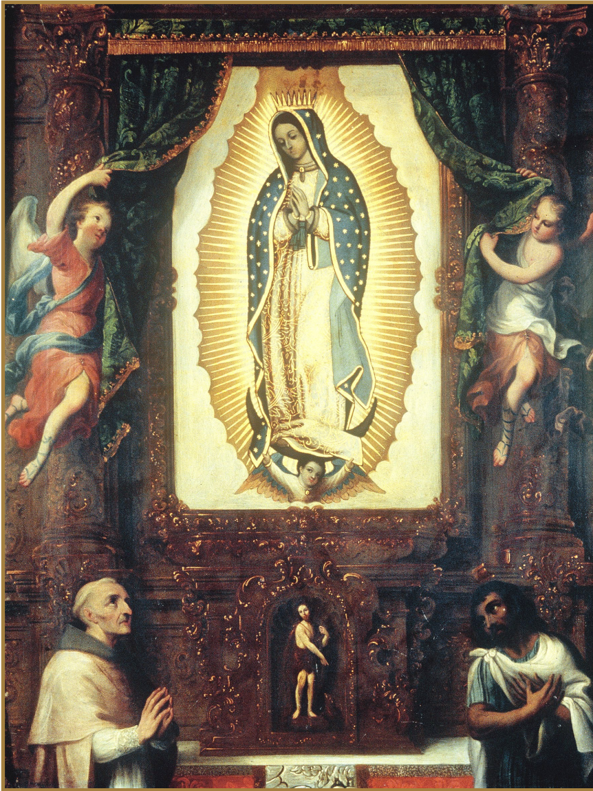
Miguel Cabrera, Altarpiece of the Virgin of Guadalupe with Saint John the Baptist, Fray Juan de Zumárraga, and Juan Diego . Museo Nacional de Arte, Mexico City.

The apparition of Our Lady of Guadalupe to Juan Diego in 1531 represents a major turning point for the indigenous people of North America, and a more refined understanding of Mary for the Church in general.