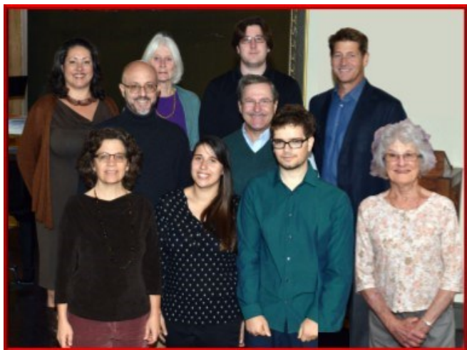
Featuring the Schola Magdalen (our 11:00 a.m. Mass Choir)

Saturday, December 22 nd 7:30 p.m. Lecture; 8:00 p.m. Concert St. Mary Magdalen Church Tickets range from $15 to $35 Advance (discount) tickets: mysteryandjoy.brownpapertickets.com