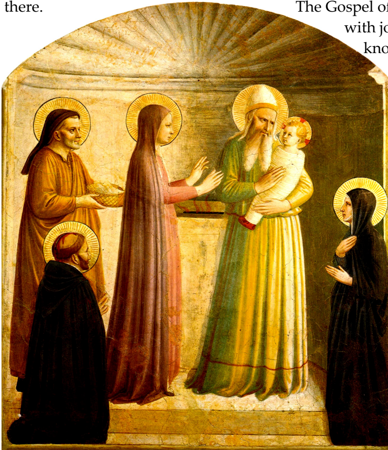
Presentation of Jesus at the Temple by Fra Angelico (1450-1452) Museo Nazionale di San Marco, Florence, Italy.

The Gospel of Luke (2:22-40) records that Simeon, overcome with joy at seeing the child, exclaimed the prayer we know as the Nunc Dimittis . (It is reproduced below.)