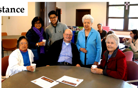
Help the 9:30 a.m. Coffee Hour 'Regulars'!