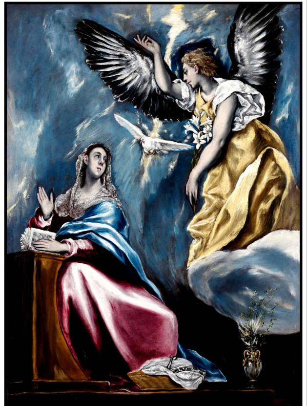
El Greco, The Annunciation , ca. 1595-1600. Szépművészeti Múzeum (Museum of Fine Arts), Budapest.

What the Old Masters missed in these portrayals was the wrenching predicament that this Good News presented for Mary. To all outward appearances she was to be an unwed mother—a far more dire situation than it is today. There was the question of how Joseph, her fiancé, would react. Upon receiving the news of God's will, her son, Jesus, was to retreat to the desert for forty days of prayer and fasting. It stands to reason that Mary must have been similarly troubled.