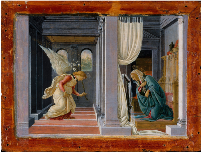
Botticelli (Alessandro di Mariano Filipepi), The Annunciation , ca. 1485-92. Metropolitan Museum of Art, New York.

Artists of the Middle Ages and Renaissance (e.g., Botticelli, El Greco) portrayed the Annunciation by depicting Mary quietly reading a prayer book in her private chapel. A glorious angel whispers God's will into her ear, which she almost passively accepts. The symbolism in these settings is that Mary was a refined woman, always ready to do God's will.