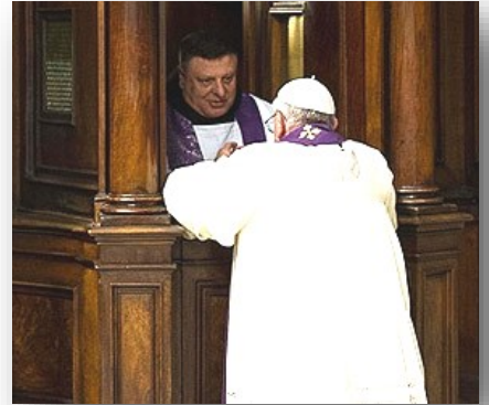
Our Holy Father at Confession.

Since the Fourth Lateran Council (1215), the Church has required that all adult Catholics receive the Sacrament of Reconciliation at least once a year during Easter Season (which lasts from Ash Wednesday through Trinity Sunday). Protestants have told me this requirement is among their objections to Catholic Church's authority. My response: "It is reasonable that the Church impose the responsibility of getting right with God at least once a year."