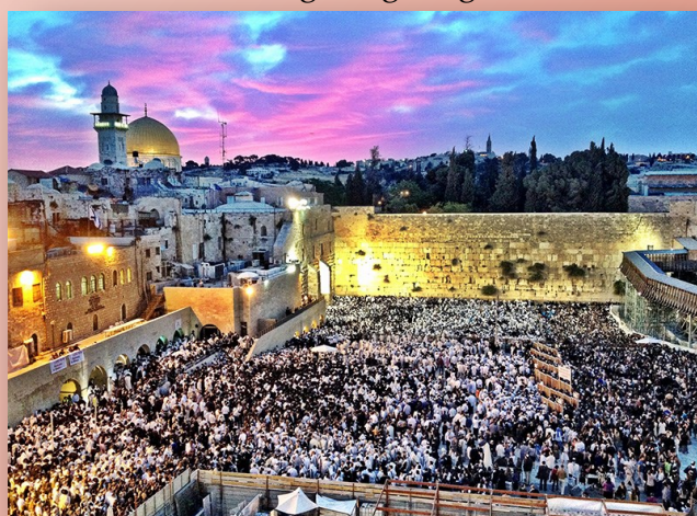
Traditionally, the holiday of Shavuot is marked by an all-night Torah study session. In Jerusalem, tens of thousands of people finish off the nighttime study session by walking to the Western Wall before dawn and joining the sunrise minyan there, seen here on May 26, 2012.

Our modern lives may be no longer connected directly with the harvest. Most of us may have little sense of the journey that led from the Exodus to the giving of the Law. But we still have the presence of the Holy Spirit that gives life to us and the Church.