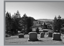
Overlooking Beautiful San Francisco Bay

Serving Local Parishes and All Catholic Cemeteries With the Utmost Care Since 1962