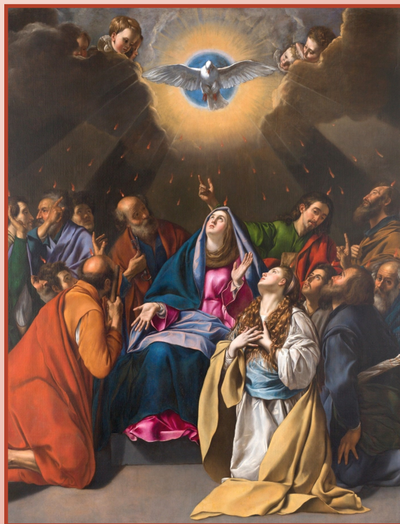
Fray Juan Bautista Maino, OP. (Pastrana, Guadalajara, 1581 - Madrid, 1649) [Painted for the high altar of the convent of the Barefoot Carmelites in Toledo.]

How do we receive that Spirit? Is Pentecost something of an afterthought following Easter, or do we see it as the beginning of the Church's ministry? As we celebrate the feast this weekend, let us pray that the Spirit may give us all the will and energy to live out our lives conscious of God's grace in everything we do.