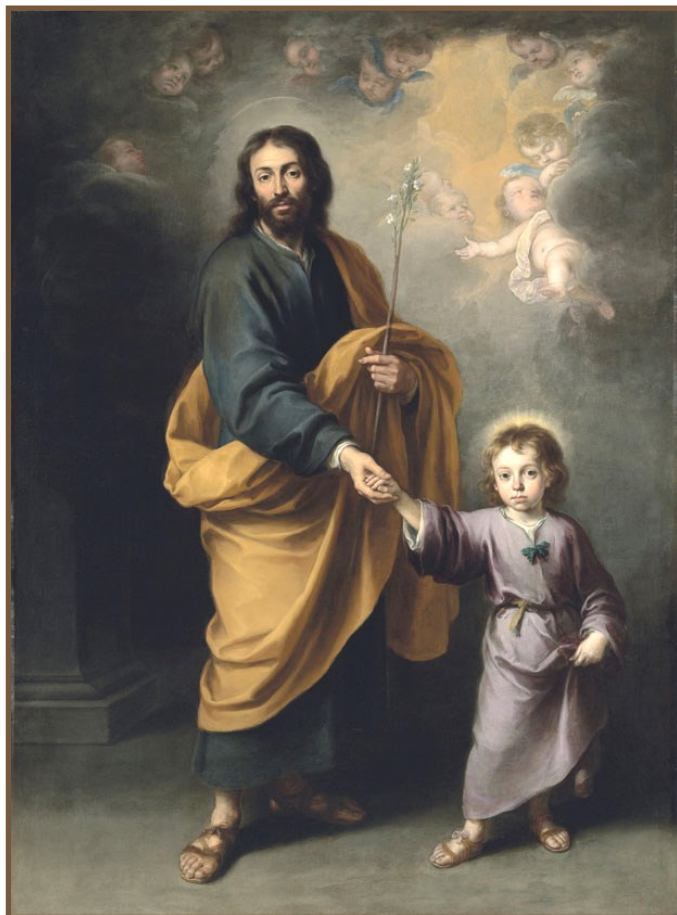
"St. Joseph and the Christ Child," Bartolomé Esteban Murillo (1618-1682).

Fathers, do you allow your children to be close enough to you that they can curl up in your arms and call you Daddy? When we are older children do we allow our fathers continued intimacy? Jesus tells us that this is the ideal relationship between God and ourselves. As we celebrate Fathers' Day, let's take some time to consider the ideal parent—child relationship and the ideal of our relationship with God.