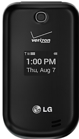
LG Verizon Flip Phone

Please join Catholic Funeral & Cemetery Services as we come together as one community to honor and pray for all our children who have been placed in the loving care of our Catholic Cemeteries.