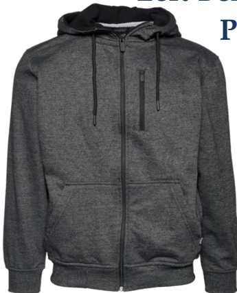
CSG charcoal grey hoodie

Please call or email Norah at the parish office to claim your lost possession: