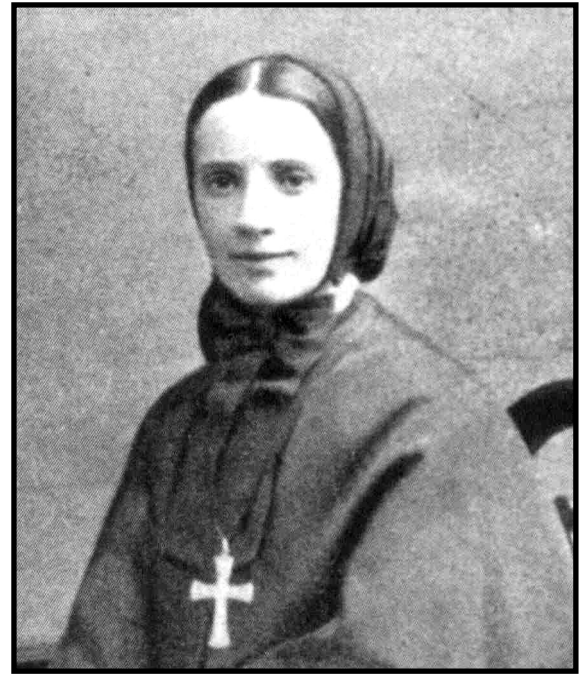
Saint Frances Xavier Cabrini, 1850-1917

St. Frances Cabrini died in Chicago of dysentery at age 67 in 1917. It can't be said that she burned herself out, as dying in one's 60s was normal for the time. On the other hand, she was working right up until her death. She was canonized in 1946 by Pope Pius XII, and her feast day took place last week, November 13 th , the date of her beatification nine years prior. Normally saints' feast days are fixed on the day of their death, but St. Frances' was moved to November, since she died on December 22 nd , so close to Christmas.