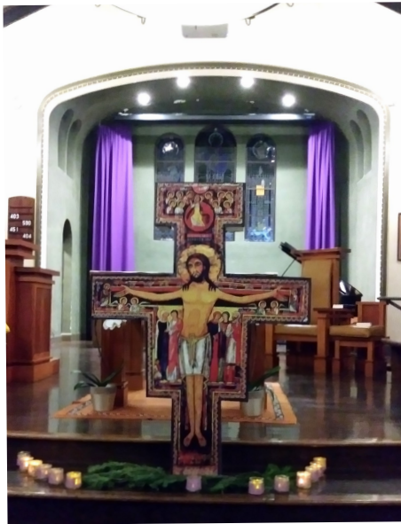
Saturday Night Taizé Service