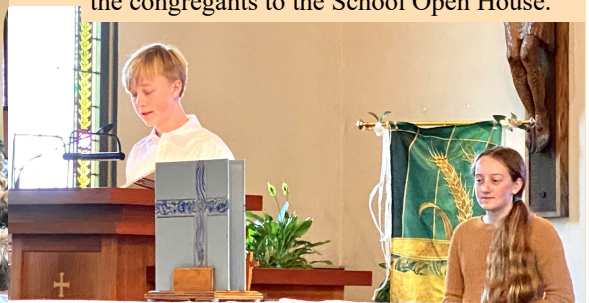
Family Mass