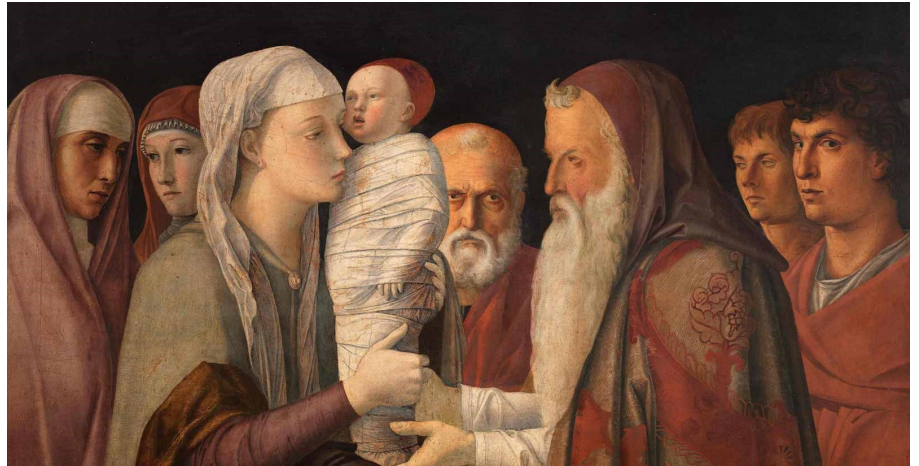
Giovanni Bellini, Presentation at the Temple, ca. 1472. Venice, Italy.

According to Jewish law ( Leviticus 12 ), a woman was required to wait forty days after giving birth before she was allowed to enter the Temple and participate in a ritual of purification. It is described in Chapter 2 of the Gospel of Luke, where Mary's purification rite is combined with the Jewish ceremony of the redemption of the firstborn ( Luke 2:23–24 ). From early times, the Church has observed it as the solemn presentation of Jesus in the House of God. It was originally celebrated on February 14 th , forty days after January 6 th , which is the Eastern feast of Christmas. Accordingly, when the Western Church moved Christmas to December 25 th , this feast was moved back to February 2 nd .