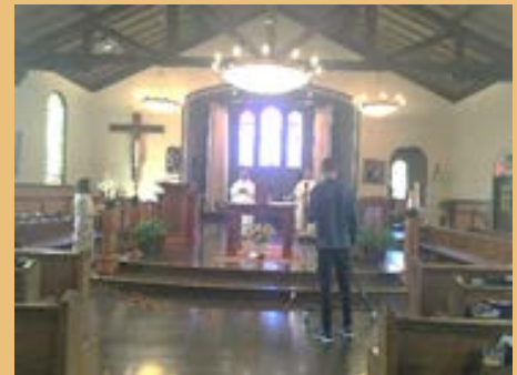
Live Stream Studio

Many of you will be able to remember the above line, a boilerplate phrase for decades whenever a radio or television program needed to break for a commercial. Sometimes it also acknowledged the people who produced the program, and this is the sense in which I am using it here. In mid-March none of us had any idea we would shelter-in-place and celebrate liturgy over the internet. It was remarkable how quickly we went from an idea to production — in literally just days!