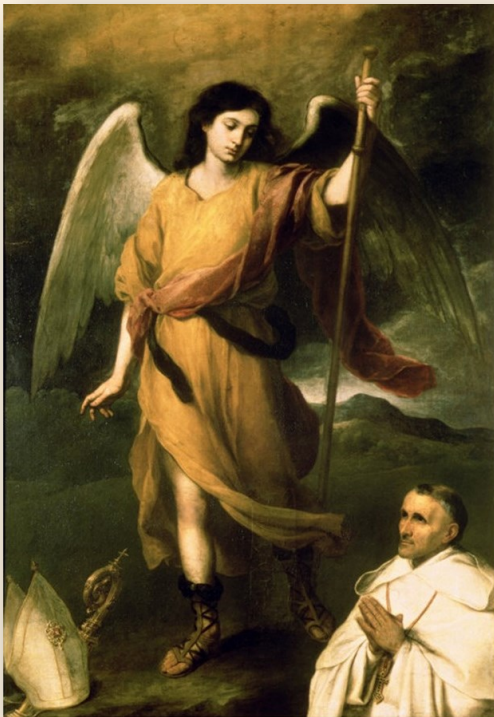
Bartolomé Murillo, Archangel Raphael with Bishop Domonte, Pushkin Museum of Fine Arts.

With the feast of Archangels on Tuesday and of Guardian Angels this Friday, it's a good time to reflect on angels in the scriptures and Church teaching. Angels appear in many religions, including Judaism, Christianity and Islam. Angels are frequently mentioned throughout the Old and New Testaments, so their existence is affirmed both in scripture and in the Church.