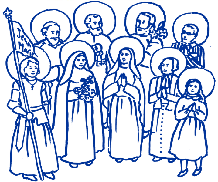
Saints on the front page: Back row: St. Francis of Assisi, St. Peter, St. Joseph, St. Maximilian Kolbe. Front row: St. Joan of Arc, St. Therese of Lisieux, Our Lady (Mary), St. Jean Marie Vianney, St. Maria Goretti. Answer to the Beatitudes Puzzle: Be a saint!

Today we celebrate all the people that are in Heaven with God. We call these people 'saints.' They were normal people like us who chose to follow God.