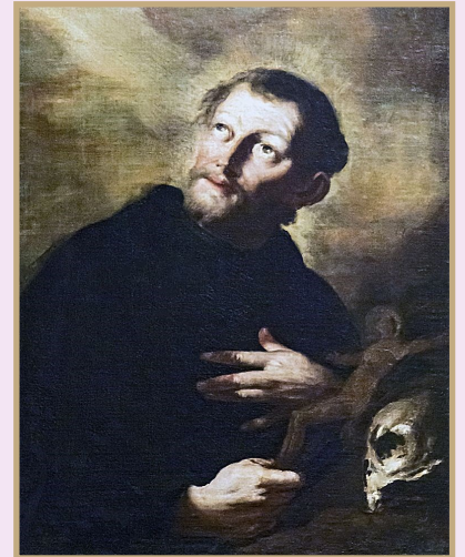
St. Philip Neri by Guiseppe Nogari

Philip spent the rest of his life in the Eternal City, where he ministered to poor pilgrims, prostitutes and the sick. In later life, these works earned him the title 2 nd Apostle of Rome . He had a knack for bringing out other's interests and engaging people from outside his social circle in lively discussions. This eventually developed into founding a house called an oratory , where prayer, performances and discussions could be held, and where the group often performed biblical stories set to music. (This, by the way, is the origin of the musical oratorio , and Giovanni Palestrina was one of Philip's followers who composed music for the services.) In 1575, Philip's society became a religious community of diocesan priests called the Congregation of the Oratory , which still exists today in 86 communities throughout the world.