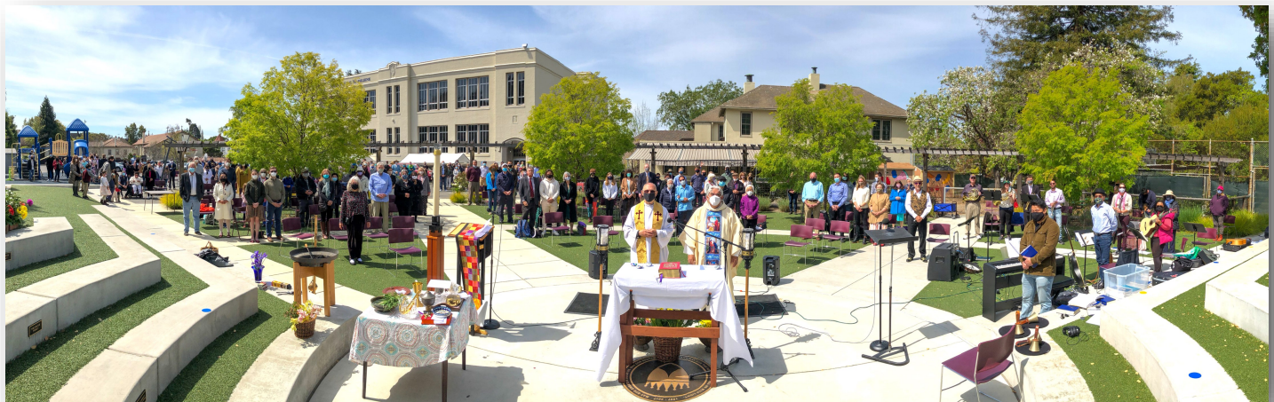
The Easter Vigil Mass was celebrated in the Dominican Garden in the late afternoon.

As we return to 'normal', you can take hospitality a step further by joining our ministries of Greeters and Ushers. You'll be back at Mass anyway, and by helping others observing safe distancing, assisting new people, helping with the collection, or making the church ready for the next liturgy, you are responding to the teaching of Vatican II to make the sacraments more rooted in the gathered community.