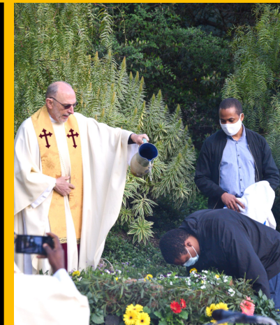
Left: the Virtual Choir (available on Facebook & YouTube). More photos to appear in next Sunday's Bulletin!