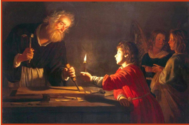
The Childhood of Christ by Gerrit van Honthorst, 1620. Hermitage Museum, St. Petersburg.

Yesterday, May 1 st , was the feast of Saint Joseph the Worker. Although Berkeley's mother church is dedicated to St. Joseph under this title (originally St. Joseph the Workman ), this feast day came much later. Like so many other feasts, the Church established it in response to events in the larger world. Communism had designated May Day as a celebration of the common worker. Pope Pius XII capitalized on this holiday by choosing to celebrate St. Joseph, patron of workers, on the same date. The feast entered the Church's calendar in 1955.