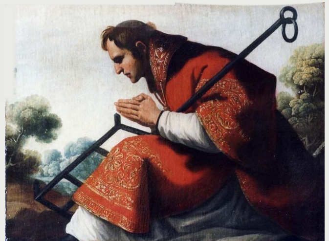
Francisco de Zurbarán (1639), Museum of Cadix, Spain.

After the execution of Sixtus II, the Prefect of Rome demanded that the Church turn over its riches to the state; however, Lawrence distributed them to the poor instead. When he presented himself to the Prefect, he brought with him "the indigent, the crippled, the blind, and the suffering, and declared that these were the true treasures of the Church." This act led directly to his martyrdom in 258 A.D. Tradition has asserted that he died by burning on a gridiron. This gave rise to his reported line: "Turn me over; I'm done on this side."