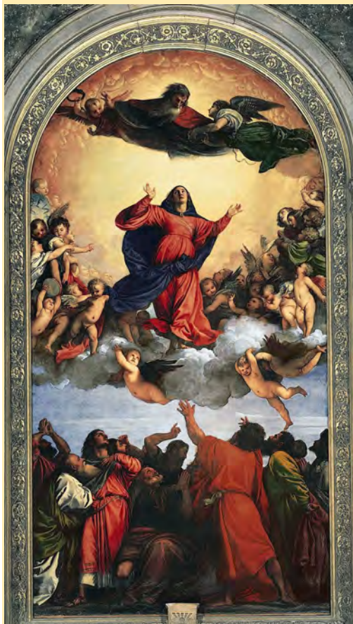
Titian, Basilica di Santa Maria Gloriosa dei Frari, Venice.

This year the Solemnity of the Assumption falls on Sunday, and so it takes the place of the normal readings we would have for the Twentieth Sunday in Ordinary Time.