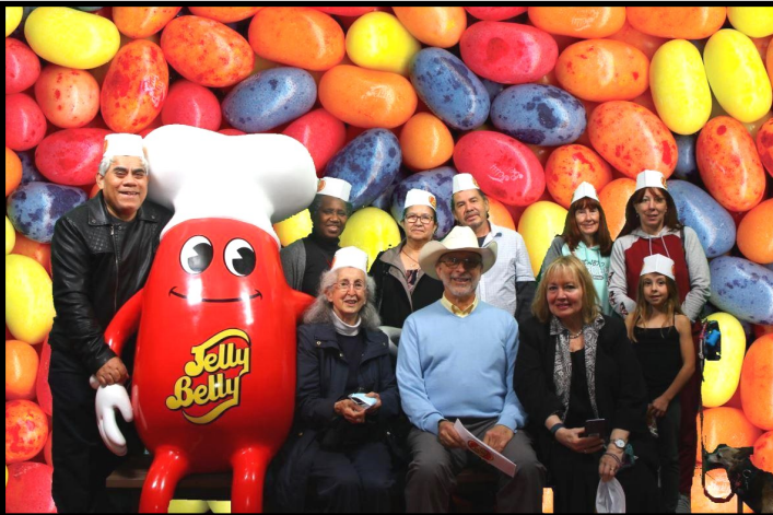
Staff Outing in Fairfield & Benicia