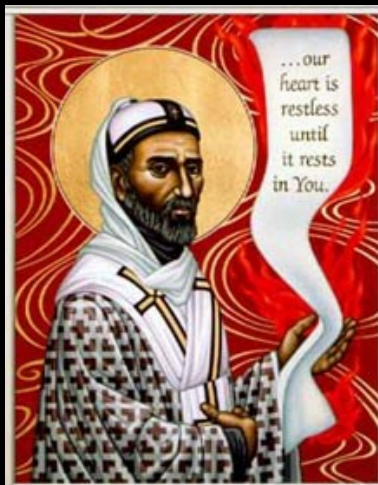
St. Augustine of Hippo