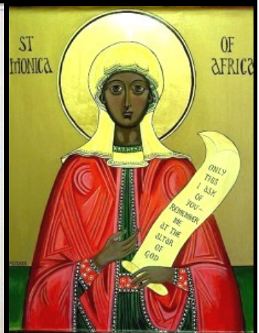
St. Monica of Africa