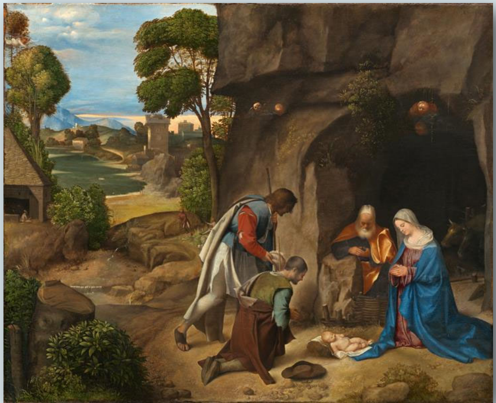
Giorgio Barbarelli da Castelfranco (Giorgione) Venice, 1505 - 1510. National Gallery of Art, Washington.

That's why the Incarnation took place in a stable rather than on a mountaintop. That's why the Christ's birth has meaning to us. And that's why in the midst of all the ballyhoo and gaudiness accompanying the celebration, we can still find peace at its core.