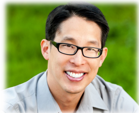
Gene Luen Yang (1973-present)