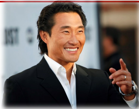
Daniel Dae Kim (1968-present)