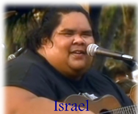
Israel Kamakawiwo'ole (1959-1997)