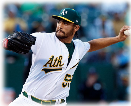
Sean Manaea (1992-present)