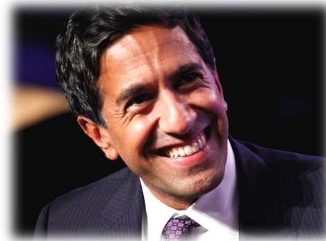
Sanjay Gupta (1969-present)