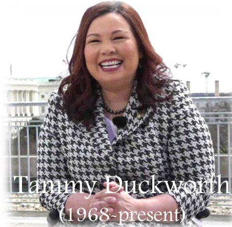
Tammy Duckworth (1968-present)