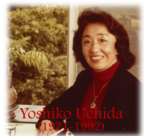
Yoshiko Uchida (1921-1992)