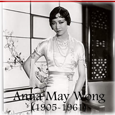
Anna May Wong (1905-1961)