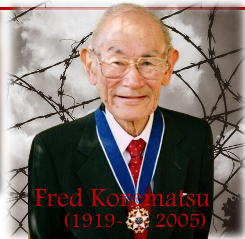
Fred Korematsu (1919-2005)