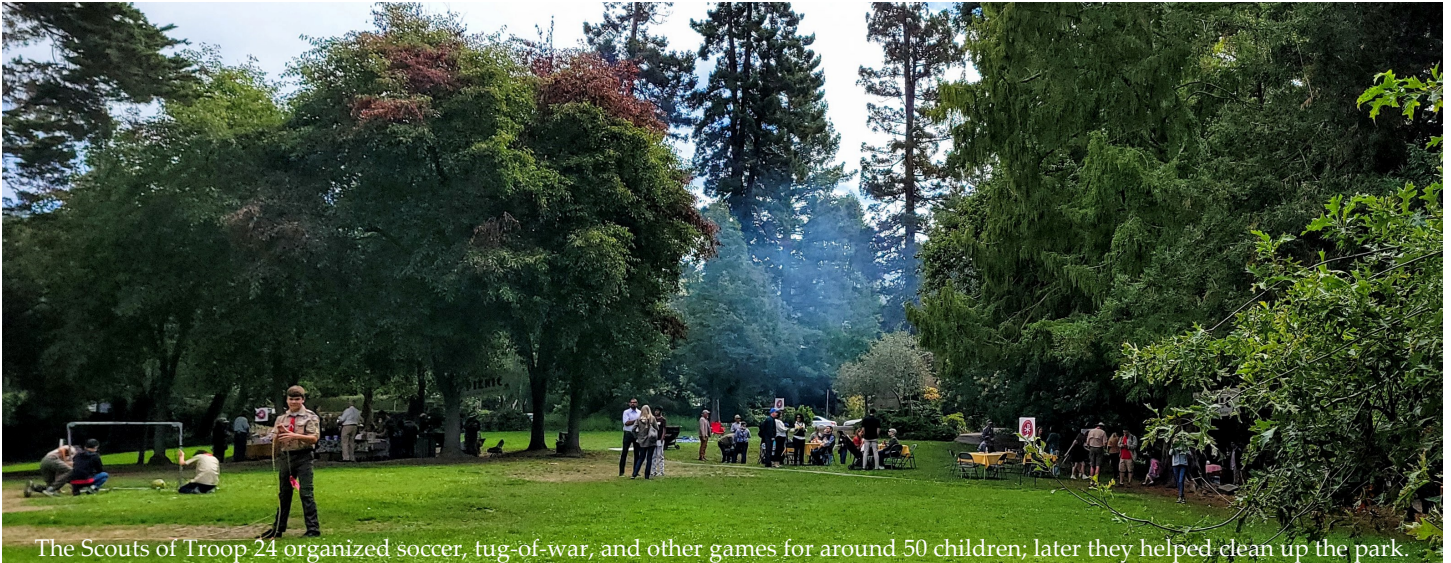
The Scouts of Troop 24 organized soccer, tug-of-war, and other games for around 50 children; later they helped clean up the park.