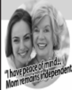
"Have peace of mind... Mom remains independent."