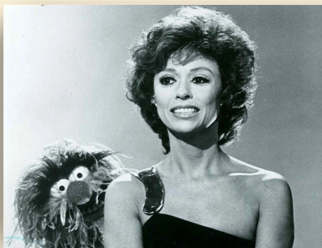
Rita Moreno 1931 - present