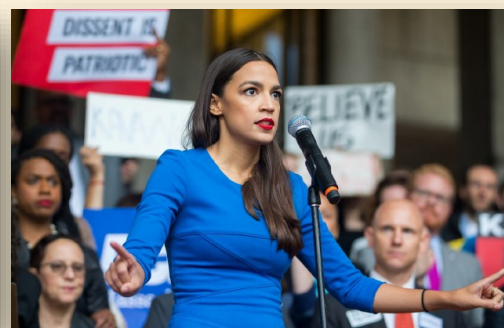
Rep. Alexandria Ocasio-Cortez 1969 - present