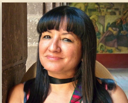
Sandra Cisneros 1954 - present