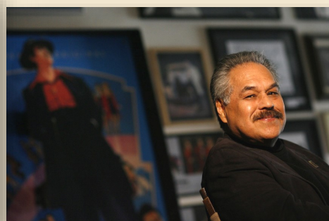
Luis Valdez 1940 - present