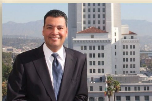
Sen. Alex Padilla 1973 - present