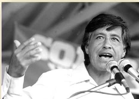
César Chávez 1927-1993