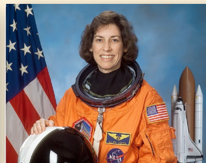
Ellen Ochoa 1958 - present