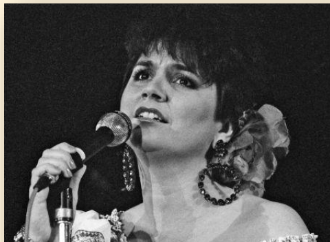
Linda Ronstadt 1946 - present