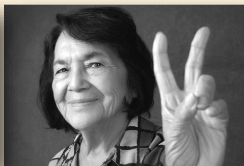
Dolores Huerta 1930 - present