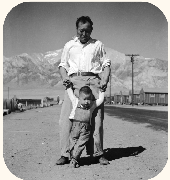
"The meanest dust storms... and not a blade of grass. And the springs are so cruel; the people couldn't keep the tarpaper on the shacks." — Dorothea Lange, at Manzanar

Saturday, November 5 th 10:30 am in the Church Admission is Free.