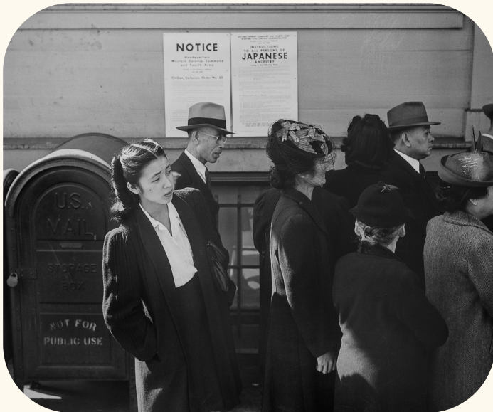
April 25, 1942 — San Francisco, California. Residents of Japanese ancestry appear for registration prior to evacuation and relocation in internment camps. censored by the U.S. military until 1966.