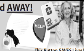
This Button SAVES Lives! As Shown GPS, Lowest Price Guaranteed!