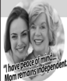
"I have peace of mind... Mom remains independent."