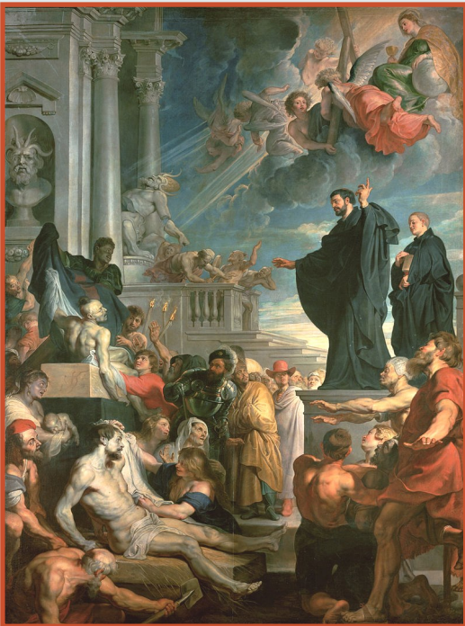
Peter Paul Rubens, Kunsthistorisches Museum, Vienna .

Francis had a wanderlust that would rival even today's world travelers. Born on April 7, 1506, to a noble family in Spain, Francis' father died when he was a young boy. Later he traveled to Rome, where he joined the Jesuits and was ordained a priest in 1537.