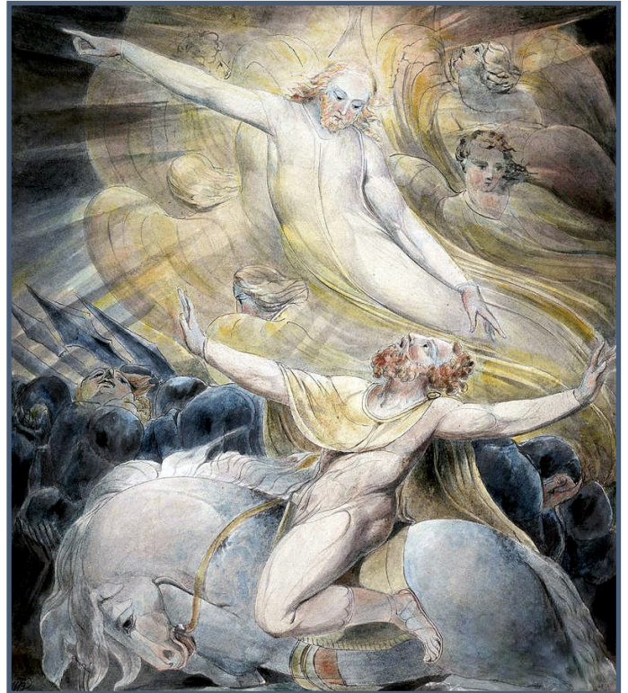
William Blake, The Conversion of Saul , ca. 1800. Huntington Library.