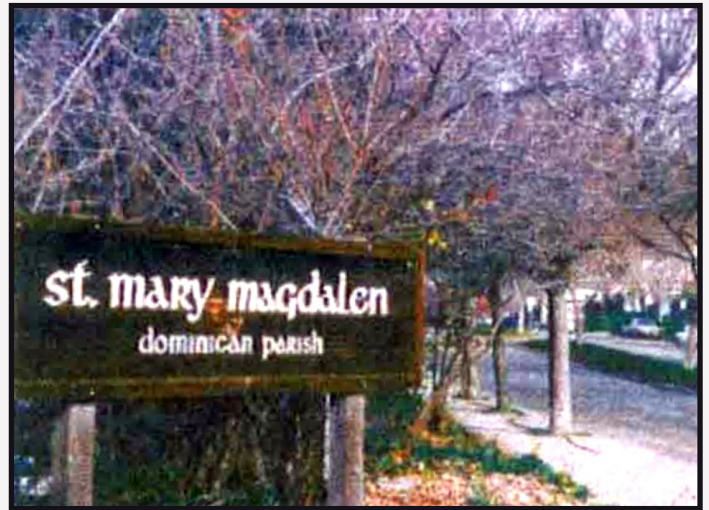
The southeast corner of our property (the northwest corner of Henry & Berryman, looking north) in 1923 and in 1999.

However, before the land could be purchased, a major obstacle had to be overcome: the property had to be rezoned.