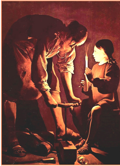
Joseph the Carpenter Georges de La Tour, c. 1645

Whether it's baking a pie or designing a new reconciliation chapel, I have a basic need to make things. My hobbies — model trains, painting and my aquarium — are often the primary outlet for this drive. The trouble is that most of my daily work is largely invisible. After Sunday liturgy or a counseling session, there is little to show for my hours of preparation, years of study and the cooperation of others. When I was writing my dissertation, there was often so little visible to account for my efforts that I would go downstairs and bake a cake so I could see the physical results of my labor.