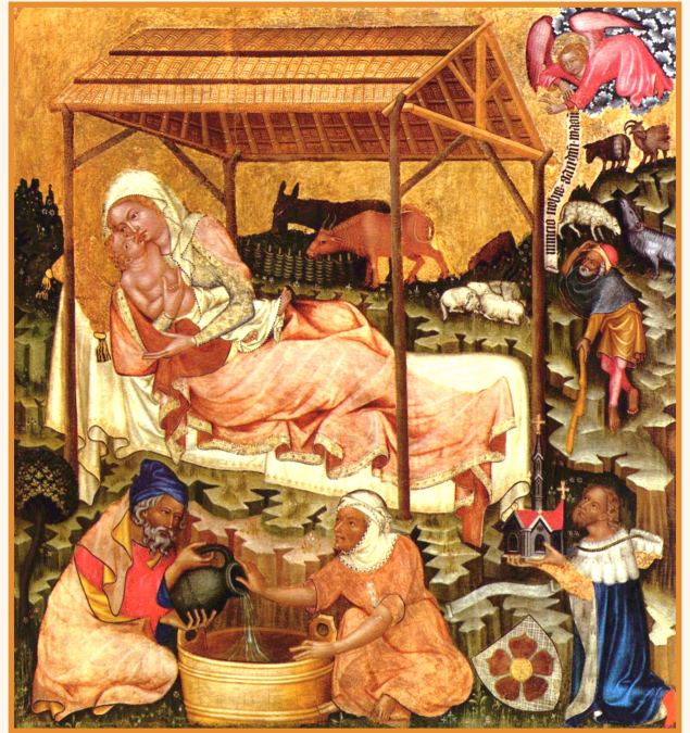
Master of Vyšší Brod, a Bohemian master, c. 1350. Convent of St. Agnes, the National Gallery of Prague.