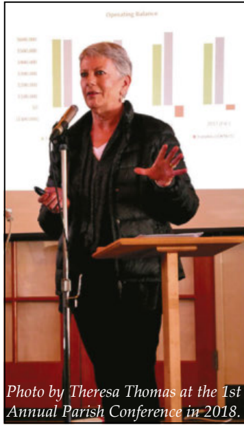
at the 1st Annual Parish Conference in 2018.