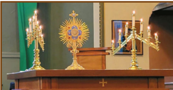
Eucharistic Adoration takes place after the 5:30 pm Mass (~ 6:00 pm) on all the Mondays of Lent.

ourselves for the coming of the resurrected Christ into our hearts. If our hearts are — physically, as well as spiritually — a little healthier on account of our Lenten efforts, so much the better!