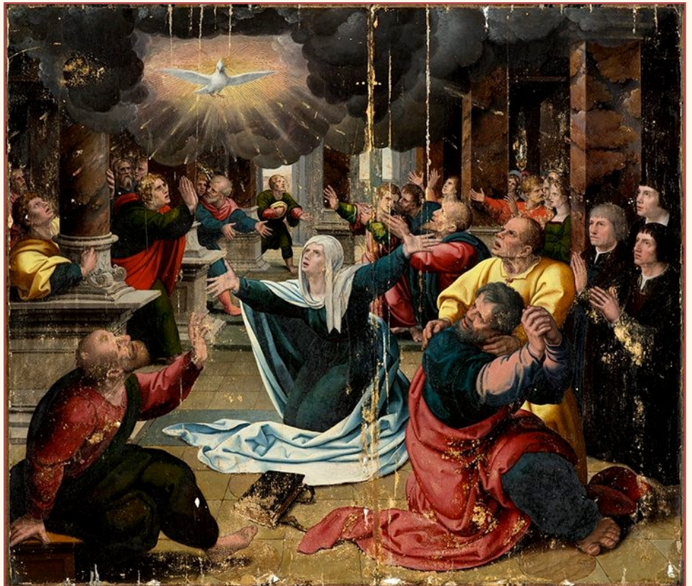
The Pentecost by a follower of Bernard van Orley, c 1530, the Netherlands. Oil on panel, 37.5 x 43.5 in., North Carolina Museum of Art

As we celebrate the feast of Pentecost, let us ask for the continued grace of the Holy Spirit, that we may have the energy to accomplish our tasks and enjoy the fruits of our work.