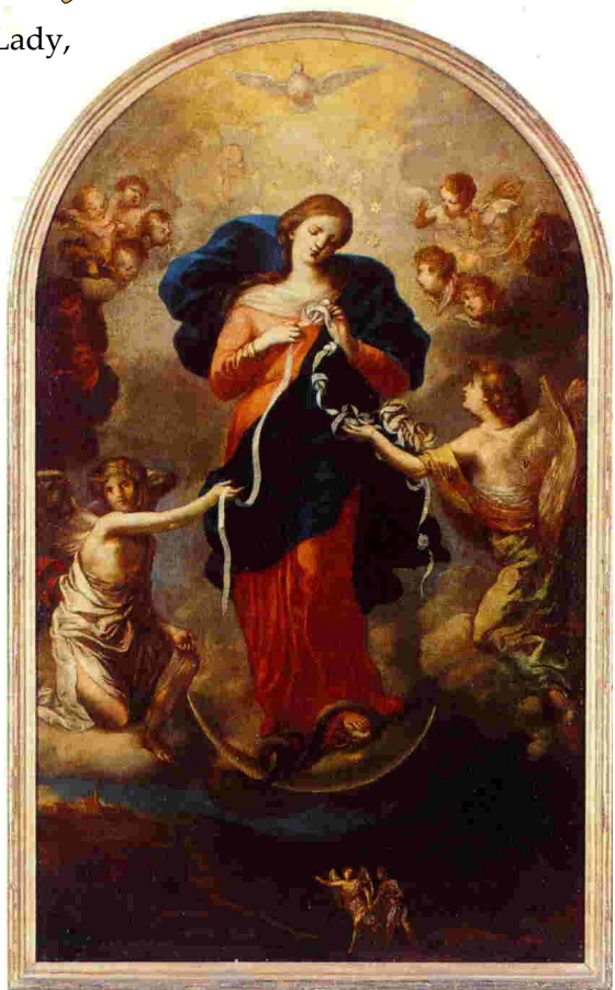
Maria Untier of Knots, c. 1700.

Mary Undoer of Knots is the same woman who quietly corrected her son when he slipped away from her and Joseph and stayed in the temple. Later, at Mary's request, Jesus changed water into wine in Cana to avoid their hosts' embarrassment. Maybe Mary, Undoer of Knots, can intercede for us: on the micro level when there are tensions in our families, and on the macro level for the tensions in our country and world. This strange and powerful image may help us see beyond our differences.