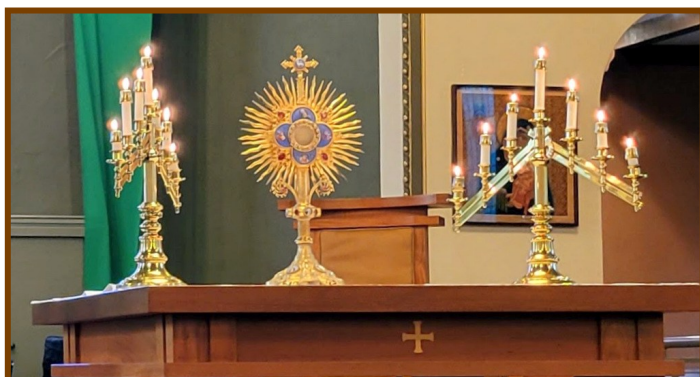
Eucharistic Adoration takes place after the 5:30 pm Mass (~ 6:00 pm) on all the Mondays of Lent.