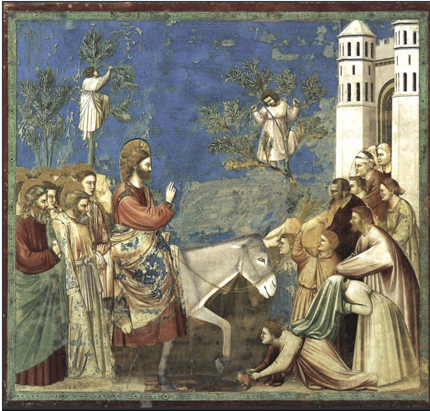
Giotto, L'entrata in Gerusalemme , 1305. Scrovegni (Arena) Chapel, Padua, Italy

Jesus' triumphal entry into Jerusalem is a study in contrasts and contradictions. All four Gospels show a remarkable agreement among each account (Matthew 21:1-5; Mark 11:1-3; Luke 19:28-31; and John 12:12-13). The disciples are told to find a donkey; they present it to Jesus, who mounts it; he rides into Jerusalem on the donkey as people lay their cloaks in his path; palm branches are waved in appreciation.