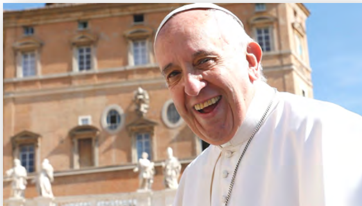
Pope Francis smiled as he arrived to lead his general audience in Saint Peter's Square at the Vatican on May 18, 2016.

Maybe one of Francis' most important works was quietly appointing strongly pastoral bishops and cardinals around the world. Let us hope that they will continue his legacy by electing a successor who continues Francis' vision!