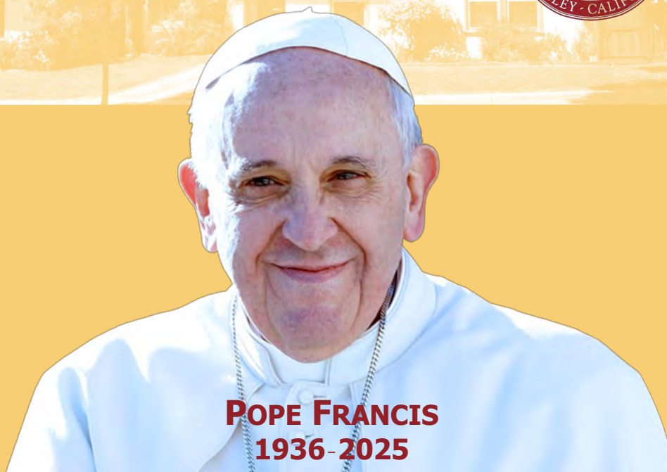
POPE FRANCIS 1936-2025